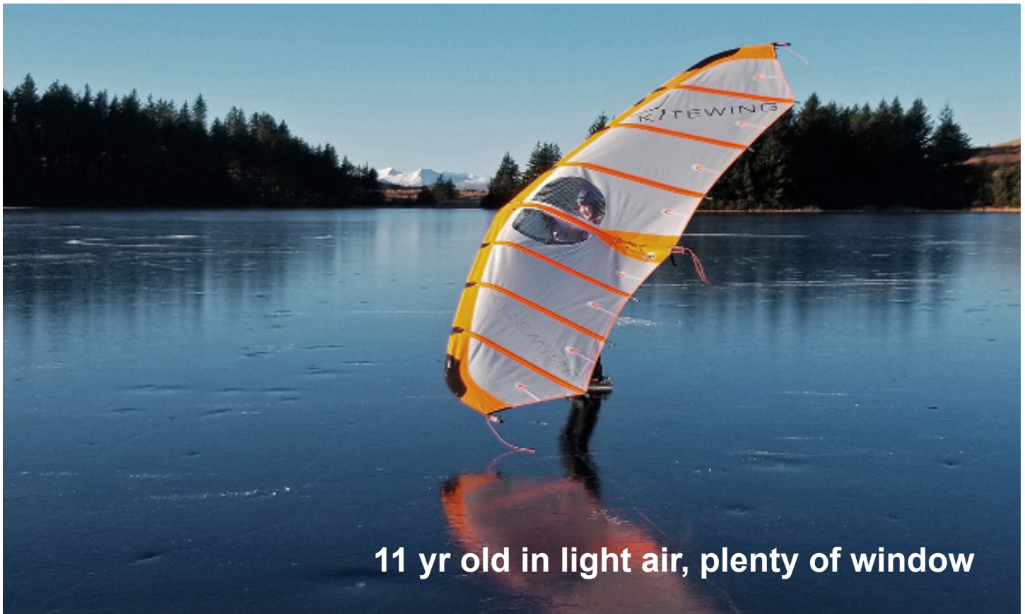
11 yr old in light air, plenty of window

The Kitewing 6.0 Pro is still a relatively nimble wing. The sixteen foot wing span is compensated by a short chord high aspect ratio. The Pro uses the same boom and Y tubes as the popular 3.0 Sport and the Kitewing 4.6.